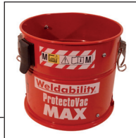
Spark arresting filter

Filter housing for internal cartridge filter